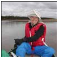
2010 JEANNINE PALMS