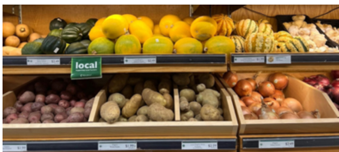
Wood bins hold more root vegetables and enhance organization.