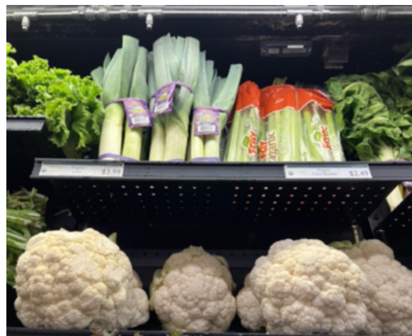
Wider shelves, aerated holes, and easy lift-out for cleaning are all features that add up to improved freshness and efficiency for the produce department and shoppers.