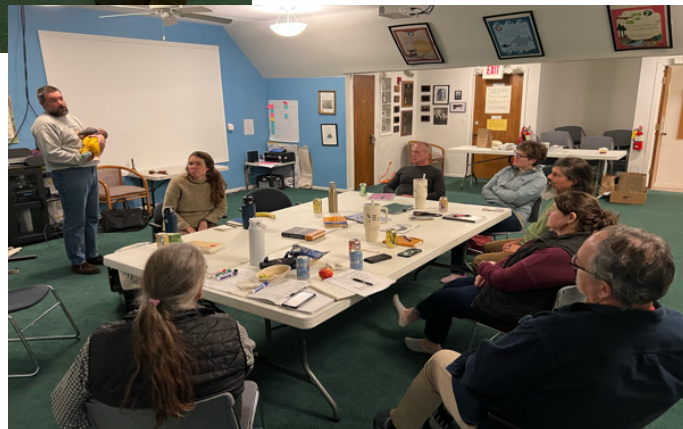
The Inter-Cooperative Council Education Center, a U MI student-owned housing cooperative, provided a warm and values-aligned space for the October Board Retreat.